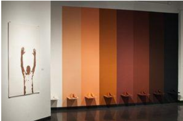
Hand's Up & Multicultural Color, Pilar Agüero-Esparza, 2017