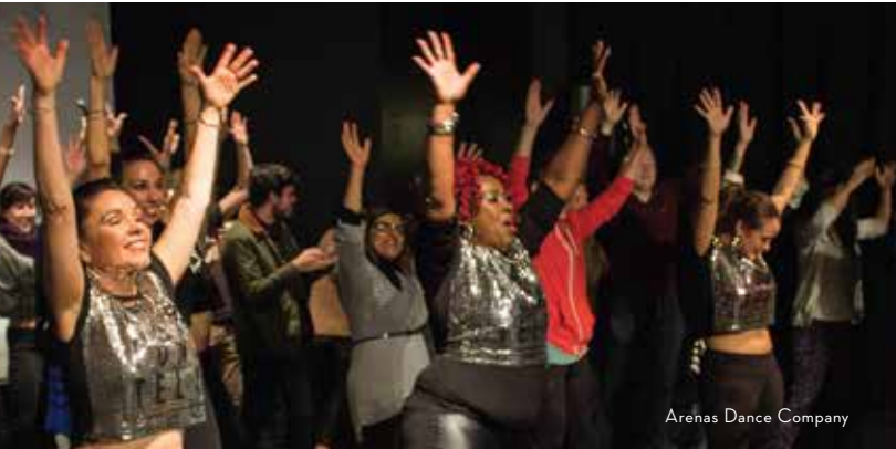
Arenas Dance Company

The South First Fridays art walk in downtown San José is a self-guided evening tour through galleries, museums, and independent creative businesses. MACLA stays open late bringing the very best music and dance artists of the Latino diaspora in the Bay Area. Move with us!